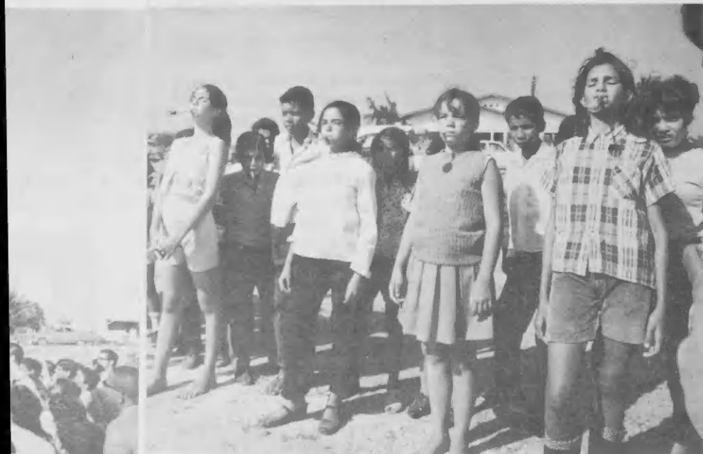
Ball-in-spoon race - Corre cu bala den cuchara.